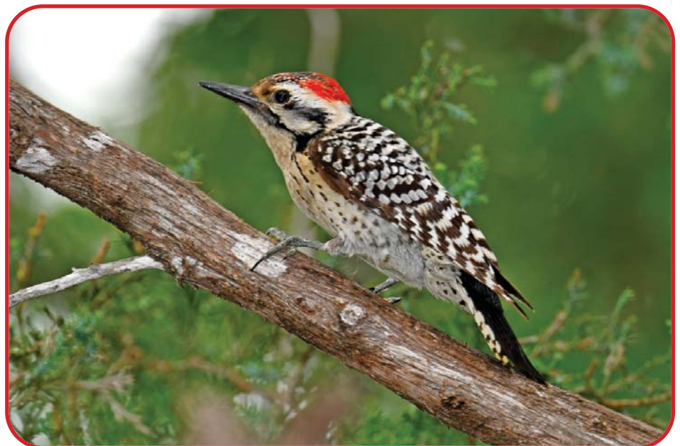
Woodpecker

Other Council Retreat Items – some of the items discussed over two meetings (a total of 9 hours) included traffic/speed related issues; junk cars; short term rentals, removal of dead trees; the Memorandum of Understanding with the Historical Society, and the roles of council and manager, including