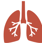
Shortness of Breath