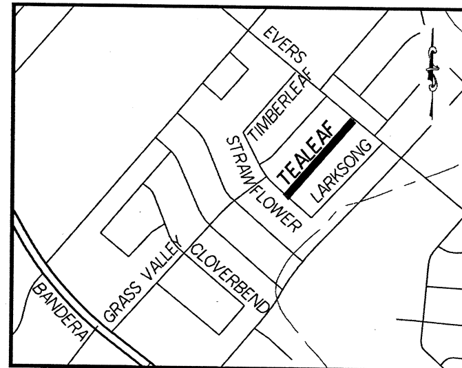
LOCATION #27: TEALEAF NTS LIMITS: STRAWFLOWER TO EVERS LENGTH: 720 FEET