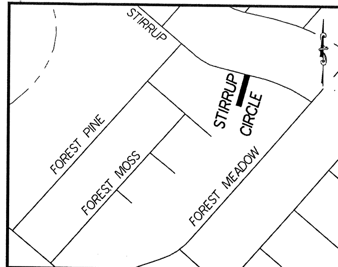
LOCATION #25: STIRRUP CIRCLE NTS LIMITS: STIRRUP TO END LENGTH: 120 FEET