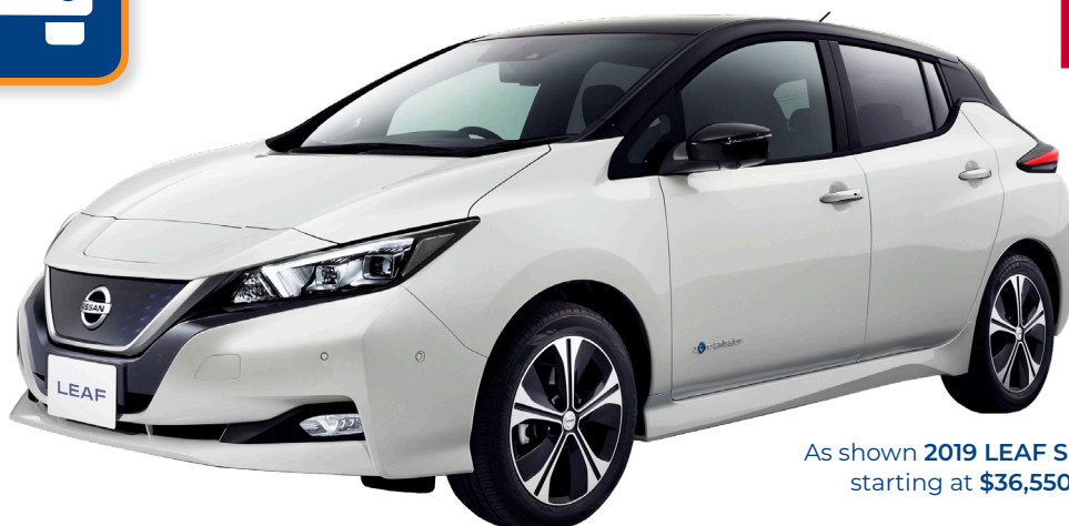
As shown 2019 LEAF S Plus starting at $36,550 1